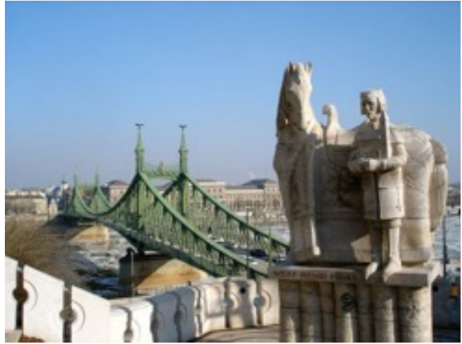
...Dreaming of our coming bridge!!

For water levels in and round the area go to: http://www.waterdatafortexas.org/reservoirs/individual/ray-