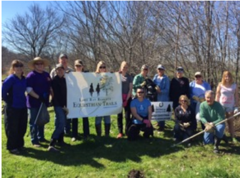
Lake Ray Roberts Equestrian Trail Association and Cross Timbers Equestrian Trail Association