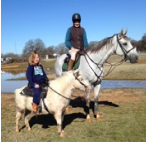
All ages and horse types are welcome to come ride!