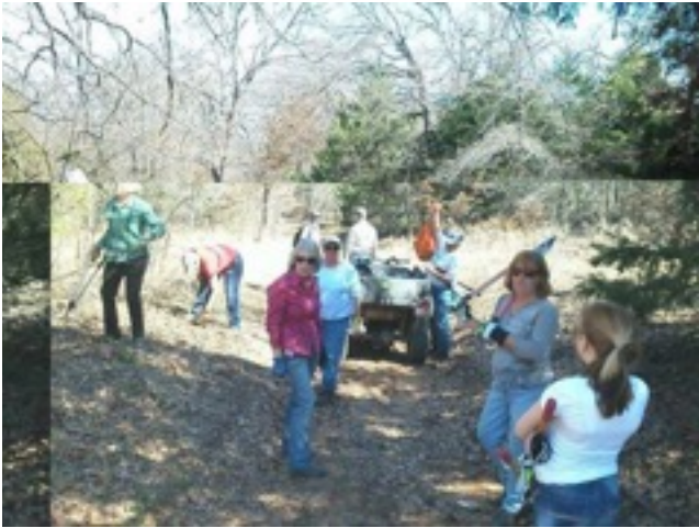
Jordan Park trimming