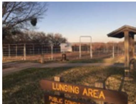
New lunging area at Isle De Bois trailhead at Ray Roberts Park!

Working on cleaning up and opening trails!